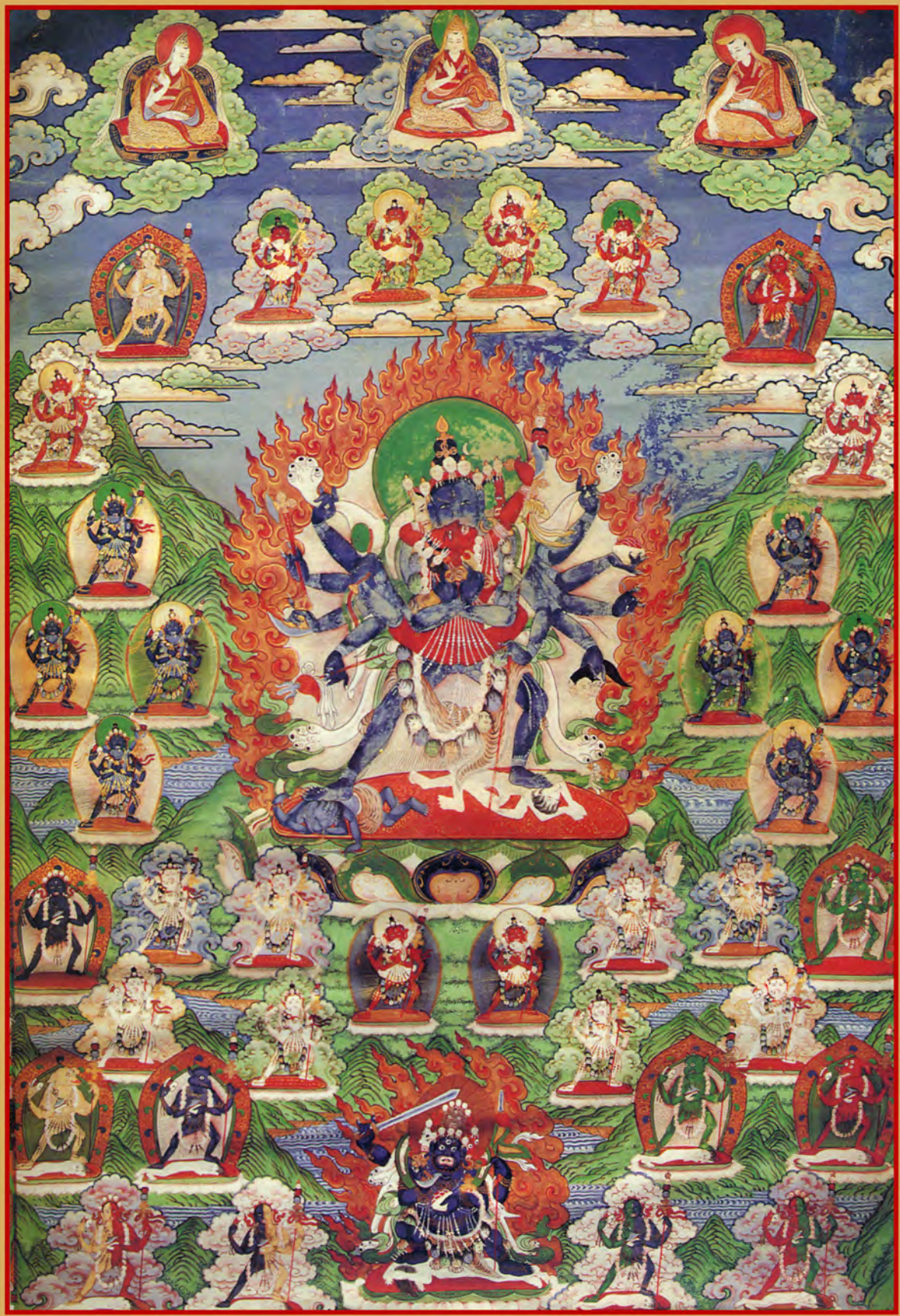
62-DEITY CHAKRASAMVARA SADHANA in the the Luipa Tradition